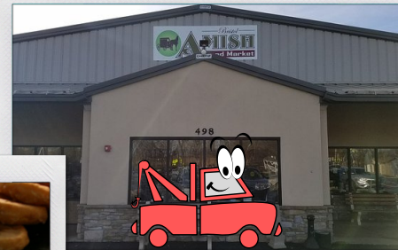
BRISTOL, PA - US