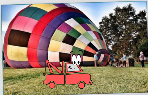
SKY RIDERS BALLOON TEAM

W.O.L.I. TAKES A HOT AIR BALLOON RIDE WITH SKY RIDERS BALLOON TEAM! WHAT A UNIQUE EXPERIENCE TO FLOAT OVER ROLLING HILLS AND FORESTS.