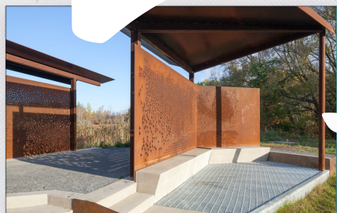
WEST HILL, ONT - CANADA

W.O.L.I. WATCHES THE SUNSET. THE EAST POINT PARK BIRD SANCTUARY PAVILIONS USE ARCHITECTURE AS A MEAN TO FRAME SKY AND WATER VIEWS WITHIN A WOODED EAST POINT PARK ATOP THE SCARBOROUGH BLUFFS.