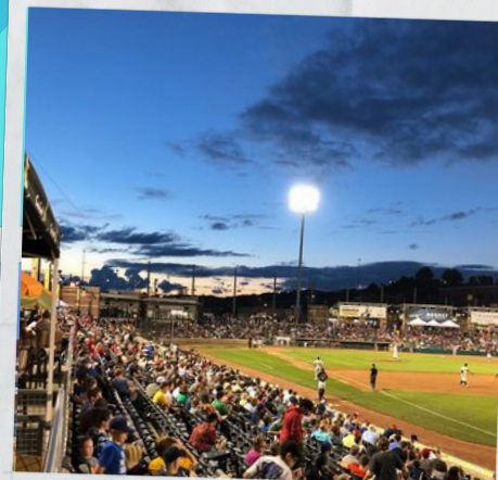
APPALACHIAN POWER PARK