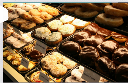
MARY'S GOURMET DONUTS

W.O.L.I. MAKES A DONUT STOP! MARY'S DONUTS ARE MADE FROM SCRATCH AND HAND ROLLED, MADE FRESH EVERY DAY. THERE ARE OVER 30 DIFFERENT KINDS OF DONUTS TO CHOOSE FROM.