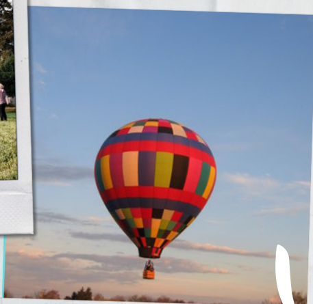
COLLEGEVILLE, PA - US

W.O.L.I. TAKES A HOT AIR BALLOON RIDE WITH SKY RIDERS BALLOON TEAM! WHAT A UNIQUE EXPERIENCE TO FLOAT OVER ROLLING HILLS AND FORESTS.