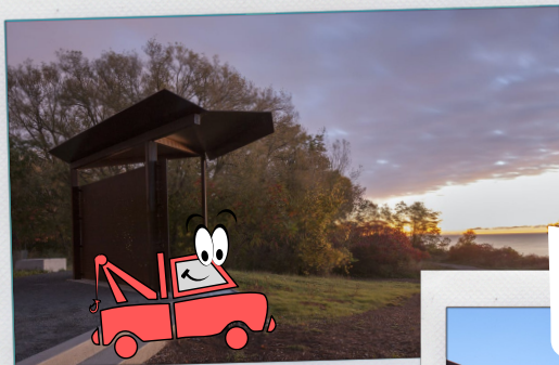
EAST POINT PARK

W.O.L.I. WATCHES THE SUNSET. THE EAST POINT PARK BIRD SANCTUARY PAVILIONS USE ARCHITECTURE AS A MEAN TO FRAME SKY AND WATER VIEWS WITHIN A WOODED EAST POINT PARK ATOP THE SCARBOROUGH BLUFFS.